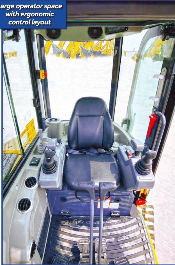
Large operator space with ergonomic control layout