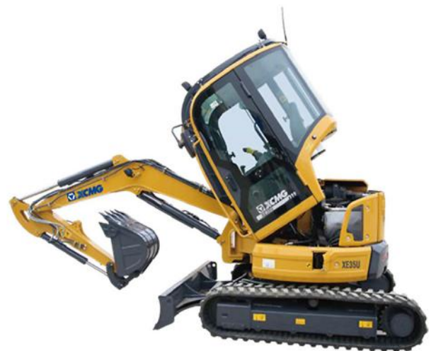
Fuel and hydraulic oil are easily replenished via the XE35U's tilttable cabin